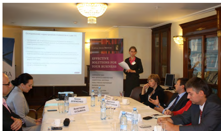
Round table “Questions of contesting the cadastral value of land in St.Petersburg”

This Committee has been operating within SPIBA since its establishment in 1995 and it provides significant input regarding the implementation of the SPIBA mission as the voice of business in its dialogue with the Russian authorities. Meetings are held with the participation of leading international and Russian firms and representatives of relevant government agencies.