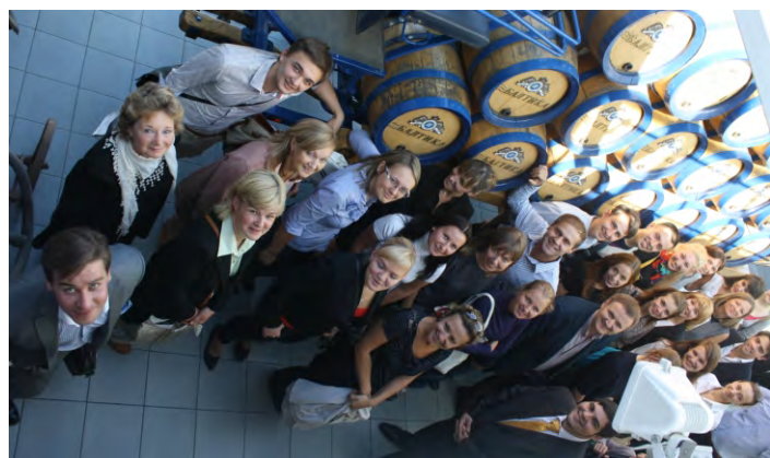
Look @ Baltika Breweries

SPIBA's Marketing & Communication Committee is engaged in attracting public attention to its members' activities. The Committee also provides an opportunity for SPIBA's members to share experience and information in the field of marketing and advertising.