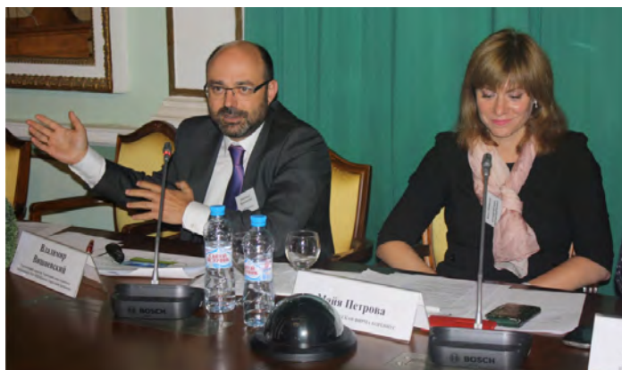
Conference "Business development - taking on new industrial sites"

Performance of the Committee is as extensive, as is the business in development and construction, often, it intersects with the activities of other committees of SPIBA and then, at the junction of two or more branches an event occurs that can benefit: lawyers, financiers, accountants, managers of state workers.