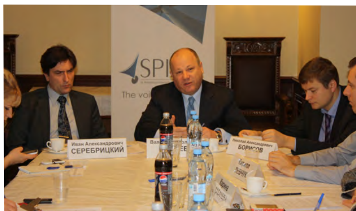
Valery N. Matveyev, Chairman of the Committee on Natural Resources, Environmental Protection and Ecological Safety of St. Petersburg