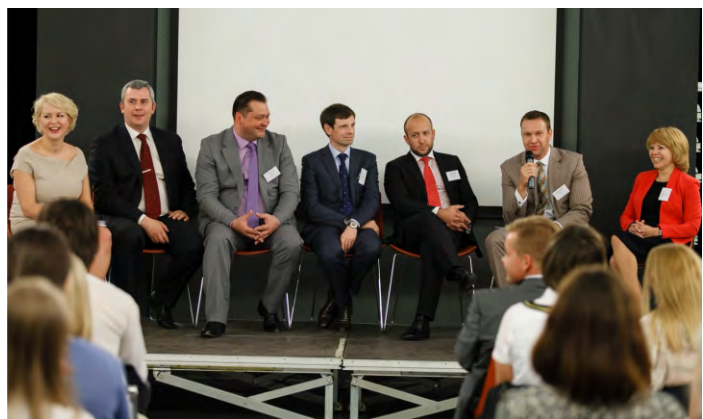
Participants of the Business Forum

On June 6th in conjunction with recruitment holding ANCOR, St. Petersburg International Business Association held a Business Forum "Investments in human capital as the key to company success."