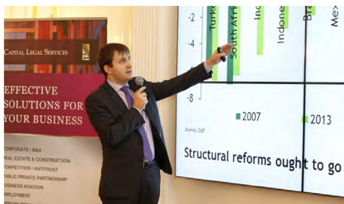
Maxim Oreshkin, Director of the long-term strategic planning department, Ministry of Finance of the Russian Federation

SPIBA's Finance Committee brings together specialists in the areas of finance, taxation and accounting. The purpose of the Committee is to create a platform for the exchange of information and to demonstrate that businesses can and should operate successfully, while respecting all the requirements of Russian legislation.