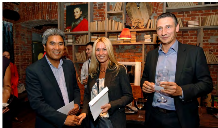
Get Together @ BIBLIOTEKA

Quality of life depends on the health state, communications in society, psychological and social status, freedom of action and choice, organization of leisure and entertainment, education, access to cultural heritage, social, psychological and professional assertiveness, psycho-type and adequacy of communication and relationships.