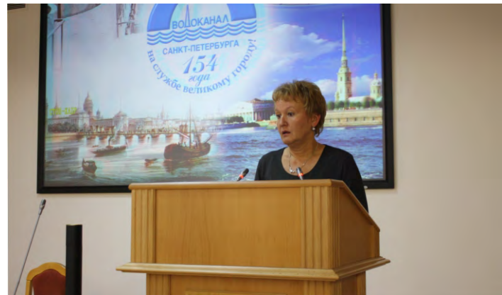
Meeting with "Vodokanal of St. Petersburg"