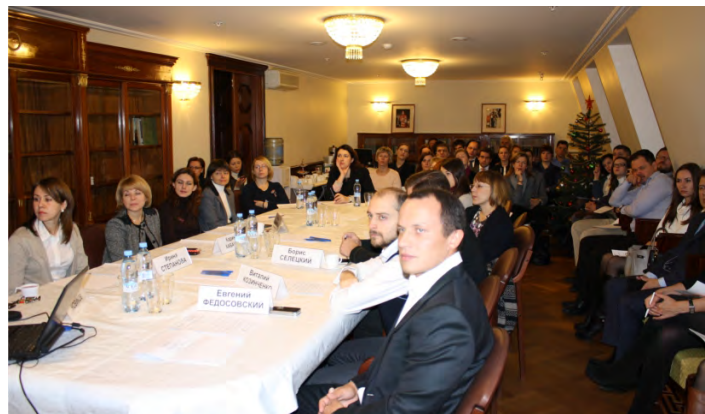
LEAN in non-manufacturing

Human capital is a key factor for successful business. Thus, SPIBA tries its best to meet its members' demands to solve problems relating to human resources.