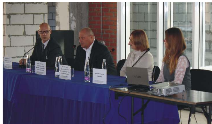
Round table «Contemporary Petersburg style: what is it?»

The SPIBA Real Estate and Construction Committee helps members of the Association navigate through the complex world of cadastres, construction codes and regulations. During the meetings of this committee we discuss issues of interest to anyone who does business in North-West Russia. Committee activities are as extensive, as is the development and construction business, often, its efforts intersect with the activities of other committees of SPIBA and then, at the junction of two or more branches an event occurs that can benefit: lawyers, financiers, accountants and managers of state workers.