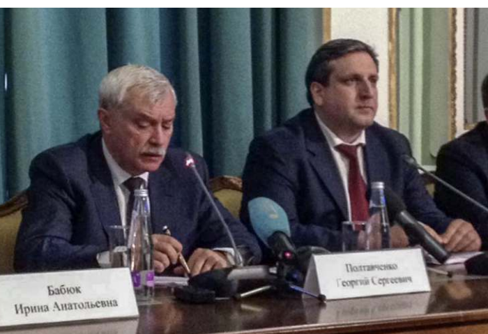
Meeting with Georgy Poltavchenko, Governor of St. Petersburg