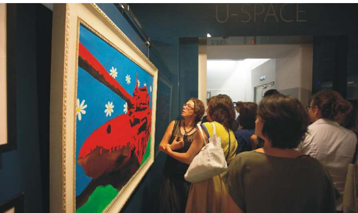
Art-Breakfast at Erarta museum

Quality of life depends on state of health, communications in society, psychological and social status, freedom of action and choice, organization of leisure and entertainment, education, access to cultural heritage, social, psychological and professional assertiveness, and adequacy of communication and relationships.