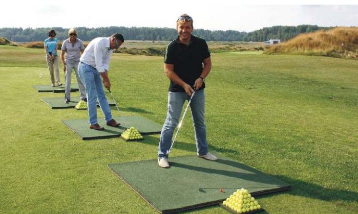
Look @ Gorki Golf Club

SPIBA's Marketing & Communication Committee is a forum for specialists in the field of marketing and PR communication. The committee is engaged in attracting public attention to its members' activities. The Committee also provides an opportunity for SPIBA's members to share experience and information in the field of marketing and advertising.