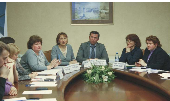
Meeting with Vodokanal of St. Petersburg and Department of the Federal Service for Supervision of Natural Resources (Rosprirodnadzor)

The Committee identifies, evaluates and analyzes key trends and issues related to environmental protection, health and safety, which may affect performance of enterprises in the North-West region of Russia. Some of the most important topics discussed are: improving the efficiency of production, quality management, and corporate social responsibility.