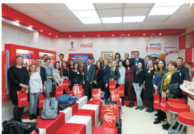
Coca-Cola HBC Russia