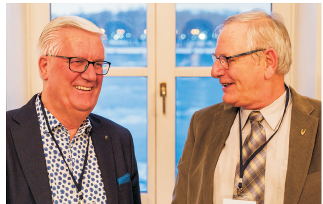
Russian-Dutch business meeting on circular agriculture "FOOD WASTE / FOOD LOSSES". Joint event with the Consulate General of the Netherlands in St.Petersburg