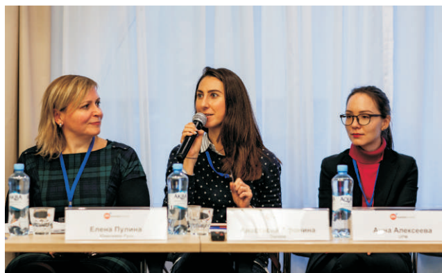
Conference "Waste processing and recycling in the ecosystem "production-retail-buyer"