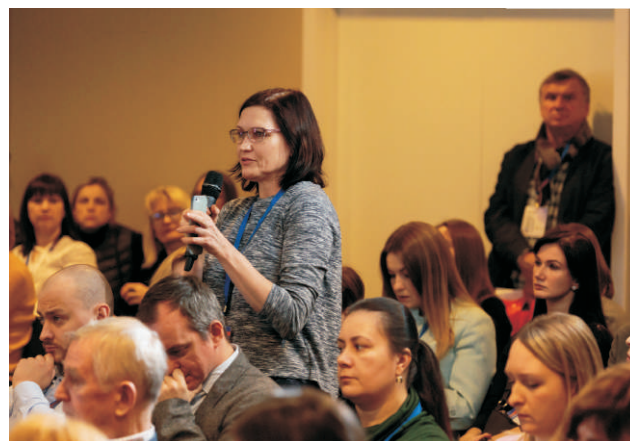
Round table «#HRtech – Agile HR»