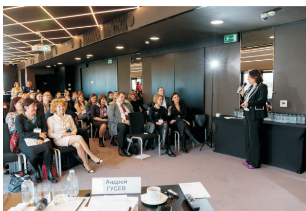
Round table "Socio-economic situation in Russia: half year results". Experts from different sectors of the economy gave an assessment and outlined forecasts for upcoming events in Russia.