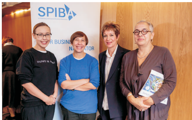
Business meeting "Brand positioning through social and cultural projects"