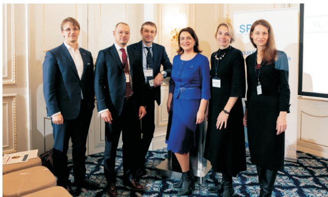
Conference "Legal Results of 2018"