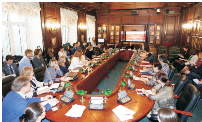
Conference "Development Trends in International Taxation in Russia"