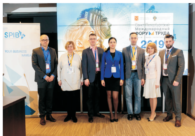
Round table “#safety – “Building a culture of safe work in various industries”