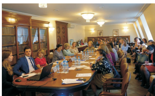
Business meeting with the management of the State Labor Inspectorate of the Leningrad Region.