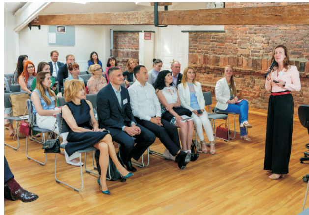
Business converge. SPIEF'19 discussion on the strategic development of companies and the prospects for landmark projects in various economic clusters.