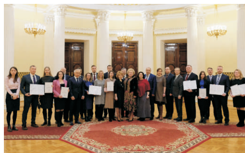
"Green code" signing at Legislative Assembly of St. Petersburg.