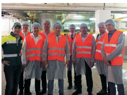
Sponsored by Heineken Breweries