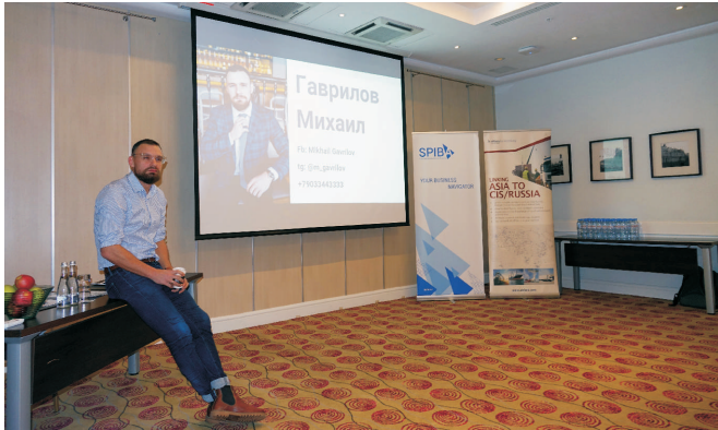
Round table "What is digital transformation and how to start it"