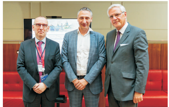
Business meeting with Kris Peeters , Deputy Prime Minister, Minister of Employment, Economy and Consumer Affairs in charge of Foreign Trade of the Belgian Federal Government. Joint event with the Consulate General of Belgium in St.Petersburg.