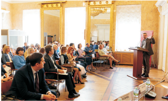
Practical conference "Interaction between universities and business"