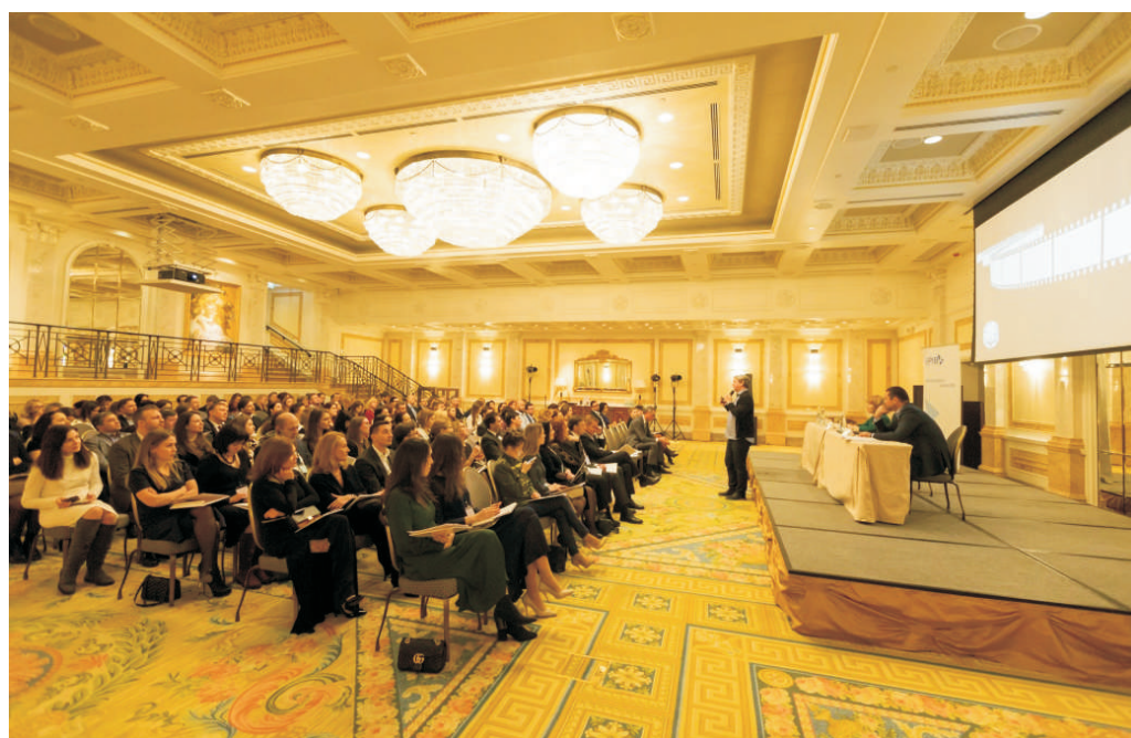
SPIBA New Year General Meeting

We are pleased to present you with the key events of 2019.