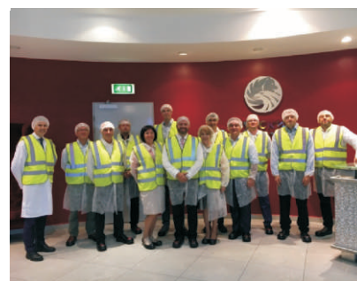
Sponsored by Russian Standard Vodka