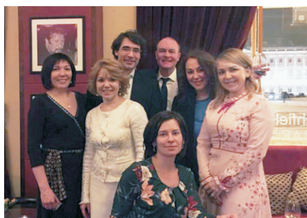
Sponsored by Astoria Hotel