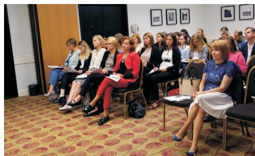
Business meeting with the Management of the Office for Migration of the Ministry of Internal Affairs of the Russian Federation in St. Petersburg and the Leningrad region.